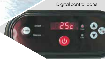
Digital control panel

Slow start to help prevent electrical surcharges Heat pump frost protection automatic operation cycle when freezing